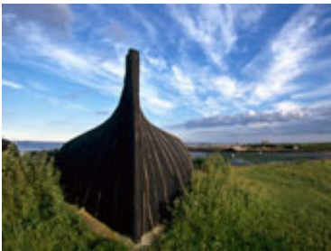
Viking ship in Lindisfarne